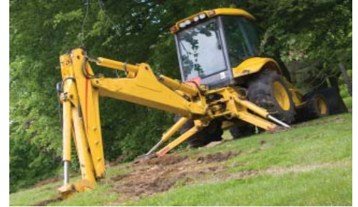
Construction Damage Remediation