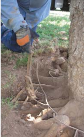
Soils and Root Management