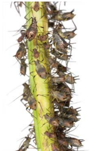
Insect Control and Remediation