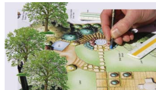
Tree Inventories / Surveys