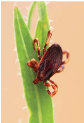
Tick Control and Management